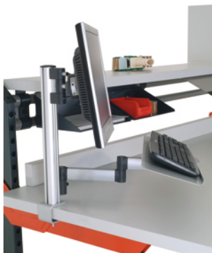
Support column with screw clamp Ref.: 509002