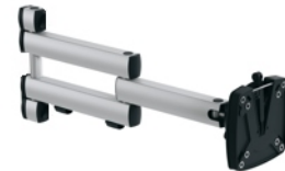
Monitor folding arm Ref.: 509204