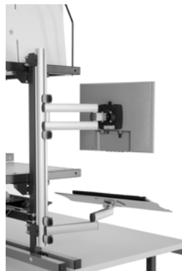
Profile rail for PC folding arms Ref.: 509005